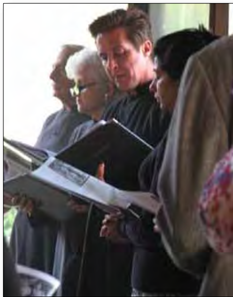
Stations of the Cross on Good Friday