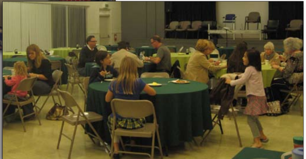
Pancakes and sausage were enjoyed by all.