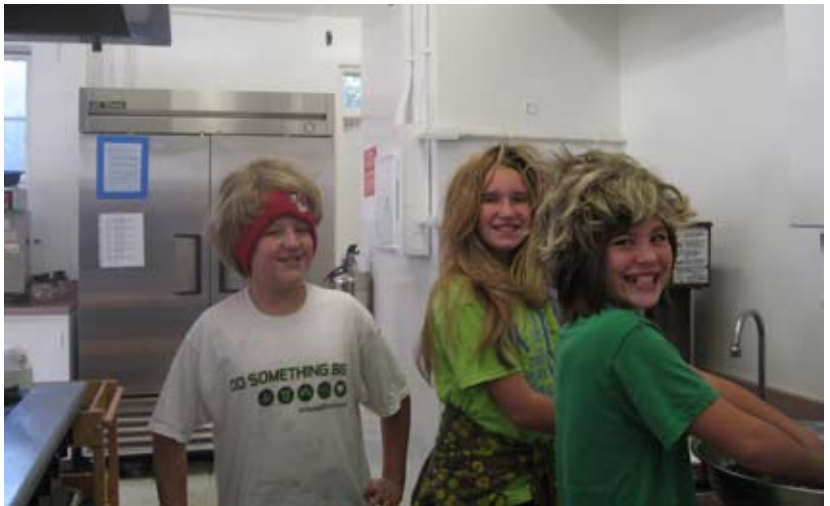
St. Michael's Community Outreach Wig Project receives help from KidsLA washing wigs.

“ We cannot live only for ourselves. A thousand fibers connect us with our fellow men; and among those fibers, as sympathetic threads, our actions run as causes, and they come back to us as effects.” Herman Melville (1819-1891) Author of Moby Dick