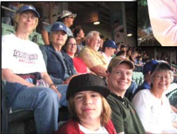
Above: GO DODGERS! This is just a handful of the THIRTY St. Michaelites at Dodger Stadium Jun 18, 2009.

Live Simply so THAT Others can Simply Live