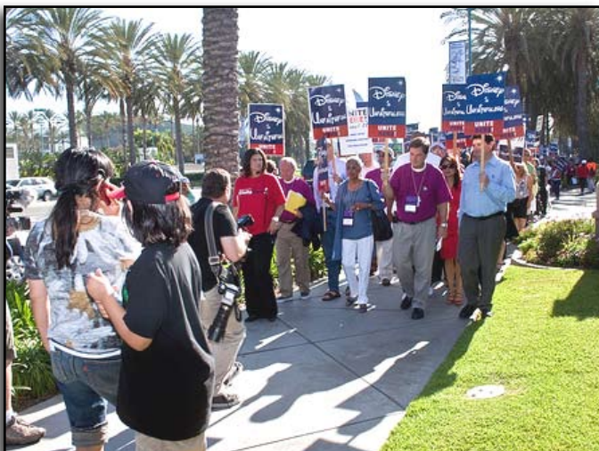
(Pictured: Bishop Robinson leading the march.)

The afternoon vigil was organized by Clergy and Laity United for Economic Justice (CLUE), the Economic Justice Network of the Episcopal Church, the Peace and Justice Commission of the Diocese of Los Angeles and Local 11 of UNITE HERE, a Los Angeles-based union that includes hotel and restaurant workers.