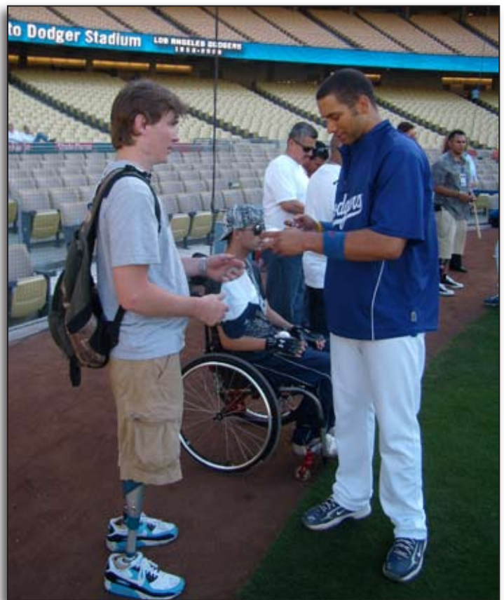
Wounded veterans meet the Dodgers as part of a VIP SoldierCare weekend.