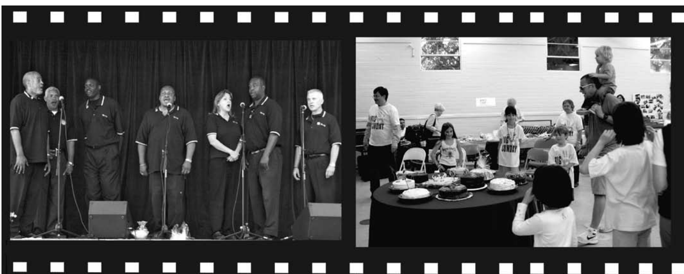
New Directions Choir